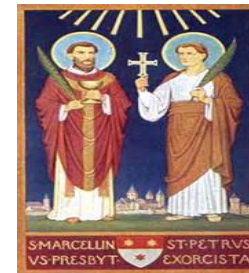
June 2 nd , Sts. Marcellinus & Peter, Martyrs

“St. of Joy” – The delightful Philip Neri gifted with a special sense of humor. Born in Florence in 1515. Philip came to Rome at age 26 and never left the Eternal City. Rome recently occupied and sacked (1527), was in pitiable condition, Philip visited the sick and imprisoned, taught the children, heard confessions. He founded the Oratorio of Divine Love – Oratorian Priests. Philip delighted in walking to the Seven Basicilicas in Rome. He died at 80, was canonized in 1622, and remains an influential force in Rome and throughout the Catholic world.