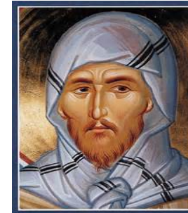
June 9 th , St. Ephrem, Deacon & Doctor

Court Our Lady of the Gulf #2267 of the Catholic Daughters of the Americas, Port Lavaca, is hosting its annual Games Party Sunday, June 14, from 1:00-5 p.m. at St. Jude Hall. Player fee is $7/person. Refreshments will be furnished.