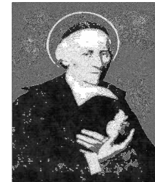
August 19 th , St. John Eudes, Priest

Our Turkey Festival is set for Sunday, September 28 th , 2014. We will be in need of Auction Item. If you have items you would like to donate, please bring them by the office. (" Be On the Lookout "...Raffle tickets for our festival will be available soon.)