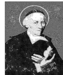
August 19 th , St. John Eudes, Priest

Our Turkey Festival is set for Sunday, September 28 th , 2014. We will be in need of Auction Item. If you have items you would like to donate, please bring them by the office. (" Be On the Lookout "...Raffle tickets for our festival will be available soon.)