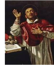
November 4 th , St. Charles Borromeo, Bishop

Tuesday, Nov. 12 th – Parish Council meeting at 7:00 p.m. in the Conference Room.