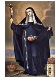
July 4 th , St. Elizabeth of Portugal

Thomas is known among the apostles especially for his unbelief. That unbelief vanished before the risen Christ. Thomas gave us the exclamation of Easter faith: “My Lord and my God!” Apart from the Gospels, nothing certain is known of his life and ministry. The Christians of Malabar (west coast of India) honor Thomas as founder of their Church. The Church of Syria takes its liturgy from St. Thomas and since 232 has honored him on this date.