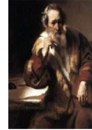
July 3 rd , St. Thomas, Apostle