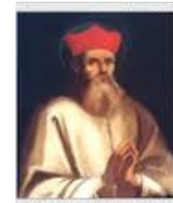
St. Peter Damian