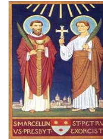
June 2 nd , Sts. Marcellinus and Peter, Martyrs

Justin, a layman, exerted a strong influence in the early Church. He went through a difficult intellectual struggle to find Christ. Born in Samaria around 100 A.D., he studied various philosophies and was converted to Christ when about 30 years old. Justin taught in Ephesus, later opened a school in Rome, and wrote defenses of Christianity. He wrote our oldest descriptions of the Baptismal rite and of Sunday Mass. Justin died a heroic martyr's death in about 165, during the persecution of the philosopher Emperor, Marcus Aurelius.