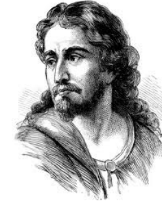
May 14 th , St. Matthias, Apostle

The Spiritual Renewal Center of the Diocese of Victoria is seeking to fill the positions of full time housekeeping and full time kitchen help . These employees will at times also be expected to work on some weekends. Please call cell 361-894-1699 for more information or application.