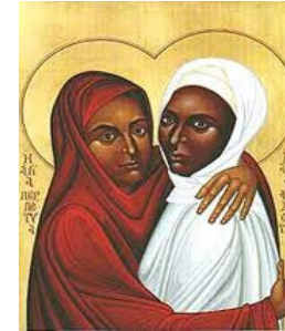
March 7 th , Sts. Perpetua and Felicity, Martyrs