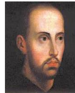
March 8 th , St. John of God, Religious

The martyrdom of these women was a dramatic episode in early Church history. Perpetua was a recently baptized, 22-year-old noble woman with a small child. Felicity, a slave, was expecting a child. With shining courage, hand in hand, they faced death from wild beasts and the sword. This happened at Carthage in North Africa, on this date in 203.