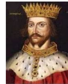
July 13 th , St. Henry,

Today's saint has been truly a blessing- for his life and for his innumerable Benedictine sons and daughters. He founded a monastic tradition based on his “Monastic Rule.” The Benedictine tradition has served both Church and civilization with distinction. Born in central Italy in 480, he studied at Rome before starting a hermit's life at Subiaco. Benedict founded the celebrated monastery at Cassino, and because of his Rule became the Patriarch of monasticism in Europe. He died on March 21, around 547.