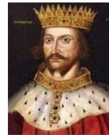
July 13 th , St. Henry,

Today's saint has been truly a blessing- for his life and for his innumerable Benedictine sons and daughters. He founded a monastic tradition based on his "Monastic Rule." The Benedictine tradition has served both Church and civilization with distinction. Born in central Italy in 480, he studied at Rome before starting a hermit's life at Subiaco. Benedict founded the celebrated monastery at Cassino, and because of his Rule became the Patriarch of monasticism in Europe. He died on March 21, around 547.