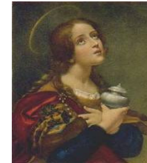
July 22 nd , St. Mary Magdalene

Baptized Julius Caesar Russo at Brindisi in Italy, today's saint was a true general for God. In 1575, age 16, he entered the Capuchins and dedicated his many talents to the Church of that Reformation century. A born orator, Fra Lawrence studied to become cultured and conversant in French, German, Greek, Syriac and Hebrew. As a worker in the Catholic Renewal he preached throughout all central Europe, campaigned against the Turks in Hungary, was an able diplomat. A true son of St. Francis, he died at Lisbon in simple goodness (1619) and was canonized a saint in 1881.