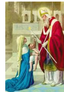
February 3 rd , St. Blase, Bishop and Martyr

The city of Turin, in Piedmont of North Italy, was in the 19 th Century a growing industrial and political center. There were hundreds of poor, abandoned boys and girls. The strong personality of Don Bosco came to their aid. A born educator, effective organizer, prolific writer, he trusted in God and accomplished wonders. He found the Salesians –orders of men and women caring for the young. This “Apostle to Youth” died in 1888 and was canonized a saint on Easter of 1934.