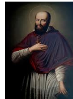
January 24 th , St. Francis De Sales, Bishop and Doctor

This saint reminds us of the noble history of deacons in the early Church. Diocletian's persecution (300-305) aimed first at purging the military. It then hit at clerics, and finally the laity. In Saragossa, Spain, the deacon Vincent was martyred with his bishop, Valerio. The early Church honored three deacon martyrs from three different nations. They were Stephen (Palestine), Lawrence (Rome), and Vincent (Spain). They were the noble ancestors of our present permanent deacons.