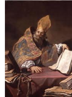
February 21 st , St. Peter Damian, Bishop and Doctor