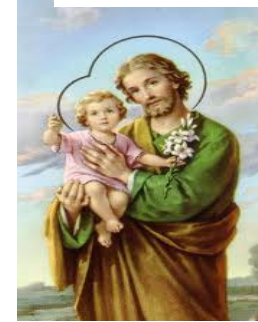
May 1 st , St. Joseph the Worker

The first day of May – “May Day” – has long been dedicated to labor and the working man. Pope Pius XII in 1955 instituted today’s feast. The Pope expressed a hope that this feast would help in teaching the dignity of labor, and would also bring a spiritual dimension to labor unions and labor legislation.