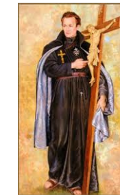
October 19 th , St. Paul of the Cross, Priest

Paul Francis Danei (1694-1775) was born in Italy, labored in commerce and military service, and then dedicated his life to meditating on the mystery of Christ's cross and to evangelizing the countryside. In 1720 he became a solitary-praying several hours a day, practicing mortification, planning a religious community. Ordained a priest, he preached effectively, saw the Passionist rule approved by the Holy See in 1741 and adopted the name of the Paul of the Cross. The Passionists developed steadily. An order of women was begun in 1771. On October 18, 1775, he died in Rome, at the ancient Basilica of Sts. John and Paul. Paul of the Cross was canonized a saint in 1867. The ideals and work of the Passionist Orders continue to advance the Church.