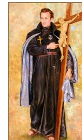
October 19 th , St. Paul of the Cross, Priest

Born of a gentile family in Antioch, Luke was a cultured man, a medical doctor, a convert to Christ. An associate of the Apostle Paul, Luke authored the third Gospel and Acts of the Apostles. These works give us much valuable information about Christ and the early Church.