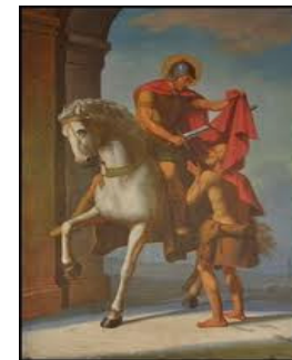
November 11 th , St. Martin of Tours, Bishop

Elected Pope in 440 and deceased in 461, Leo I shepherded the Church in most difficult times. He had to fight barbarians from without and heretics from within. Leo had to confront and turn back Attila the Hun (452), witness helplessly the sack of Rome by the Vandals (455), and at all times care for the souls and bodies of his people. Fittingly he has been called Pope Leo the Great.