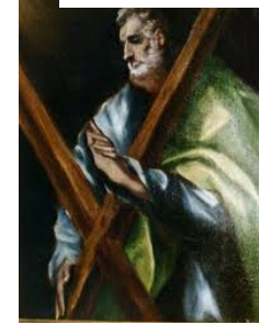
November 30 th , St. Andrew, Apostle

The Church, built on the Apostles, has from its beginning honored the Twelve. Probably at one time, each month had an Apostle’s feast. Andrew of Bethsaida (on the lake of Galilee) was Peter’s brother. Tradition recalls his crucifixion in Greece on an X shaped cross (St. Andrew’s cross).