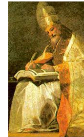
May 25 th St. Gregory VII Pope