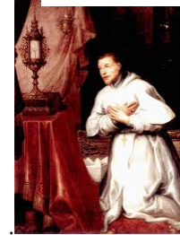
June 6 th St. Norbert, Bishop

Join with Priests for Life in praying a Pentecost Novena Prayer for Life, June 2-12. Find the Pentecost Novena prayer at www.PrayerCampaign.org . Also, please join the "Pray to end Abortion" prayer effort on facebook at www.ProLifePrayers.com .