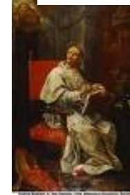
February 21 St. Peter Damian, bishop and doctor

Born at Ravenna (Italy) in 1007, Peter Damian was a professor who became a Benedictine monk. By his austere life and writings he fought against the feudal corruption which characterized his century. In calamitous times he helped the Roman Popes by his efforts on behalf of reform. Named a bishop and cardinal, he died in 1072.