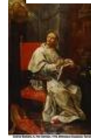
February 21 St. Peter Damian, bishop and doctor

Born at Ravenna (Italy) in 1007, Peter Damian was a professor who became a Benedictine monk. By his austere life and writings he fought against the feudal corruption which characterized his century. In calamitous times he helped the Roman Popes by his efforts on behalf of reform. Named a bishop and cardinal, he died in 1072.