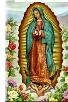
December 12 th , Our Lady of Guadalupe

** Christmas Mass Schedule – Sat., Dec. 24 th – 6:00 p.m. (Children’s Mass) 10:00 p.m. Sun. Dec. 25 th – 8:00 a.m. 10:00 a.m.