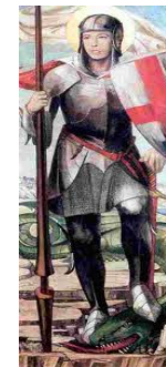
April 23 St. George, Martyr

Today's saint is one of the most significant figures in Church history, a forerunner of medieval thought. Born in North Italy (1033), Anselm became a Benedictine and an outstanding teacher of theology at his monastery in France. In 1093 he was sent to England, to become Archbishop of Canterbury. He had to defend the rights of the Church against the King, and twice suffered exile. His spiritual writings are still helpful. Anselm died in 1109.